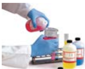
REDBACK NITRILE POWDER FREE GLOVES - GLNPFD