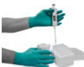
FINITE NITRILE POWDER FREE GREEN GLOVE - GLNPFDG