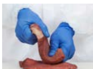
NITRIGRIP XD GLNGXD