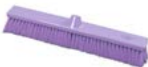
B1760 SOFT CRIMPED BROOM 500mm HBB1760