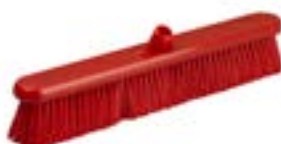
B883 FLAT SWEEPING BROOM 610mm HBB883