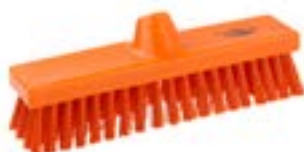
B1745 STIFF DECK SCRUB BROOM 280mm HBB1745