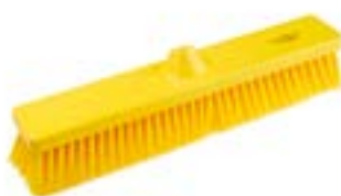
B809 FLAT SWEEPING BROOM 457mm HBB809