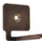
STAINLESS STEEL HOOK