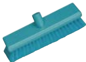
B849 FLAT SWEEPING BROOM 300mm HBB849