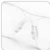
Non-slip adjustable bridge