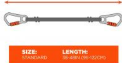
SIZE: STANDARD LENGTH: 38-48IN (96-122CM)