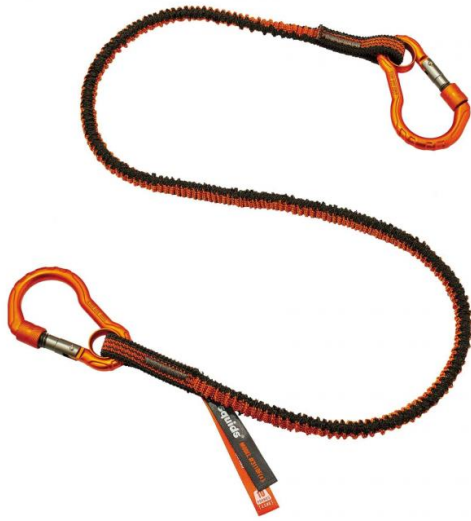
TETHER TOOLS AT HEIGHTS PREVENT DROPPED OBJECTS

ERGODYNE 1021 BANDANA BLVD EAST SUITE 220 ST PAUL, MN 55108 TOLL-FREE 800-225-8238 // INT'L +1 651-642-9889 SUPPORT@ERGODYNE.COM WWW.ERGODYNE.COM