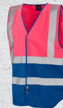
Code: W05-PK/RO Colour: Pink/Royal