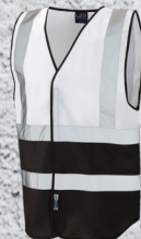
Code: W05-WH/BK Colour: White/Black