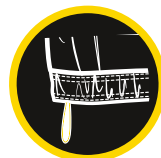
ELASTICATED HEM WITH SIDE ADJUST