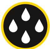
WATER RESISTANT FABRIC