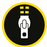
YKK MAIN ZIP LIFETIME WARRANTY